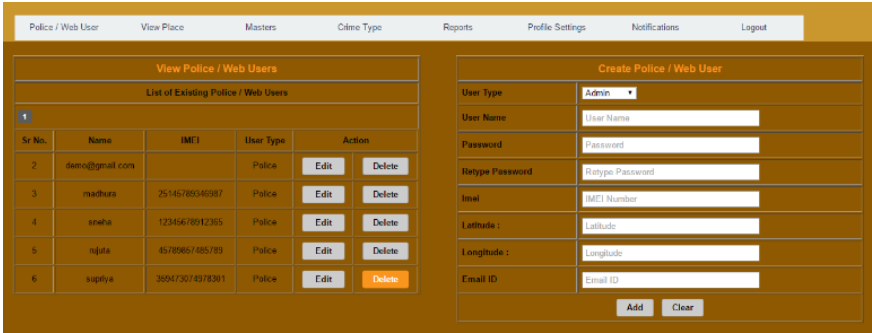
Fig. Web Portal

The administrator will login to this system.